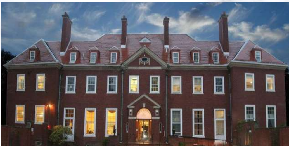
Universalist Fellowship in Morristown, New Jersey.