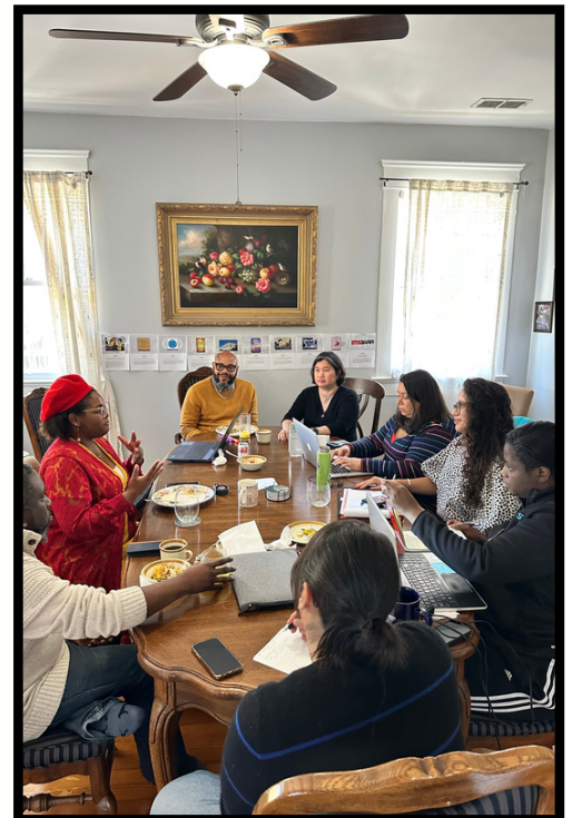
Atlanta SC Retreat