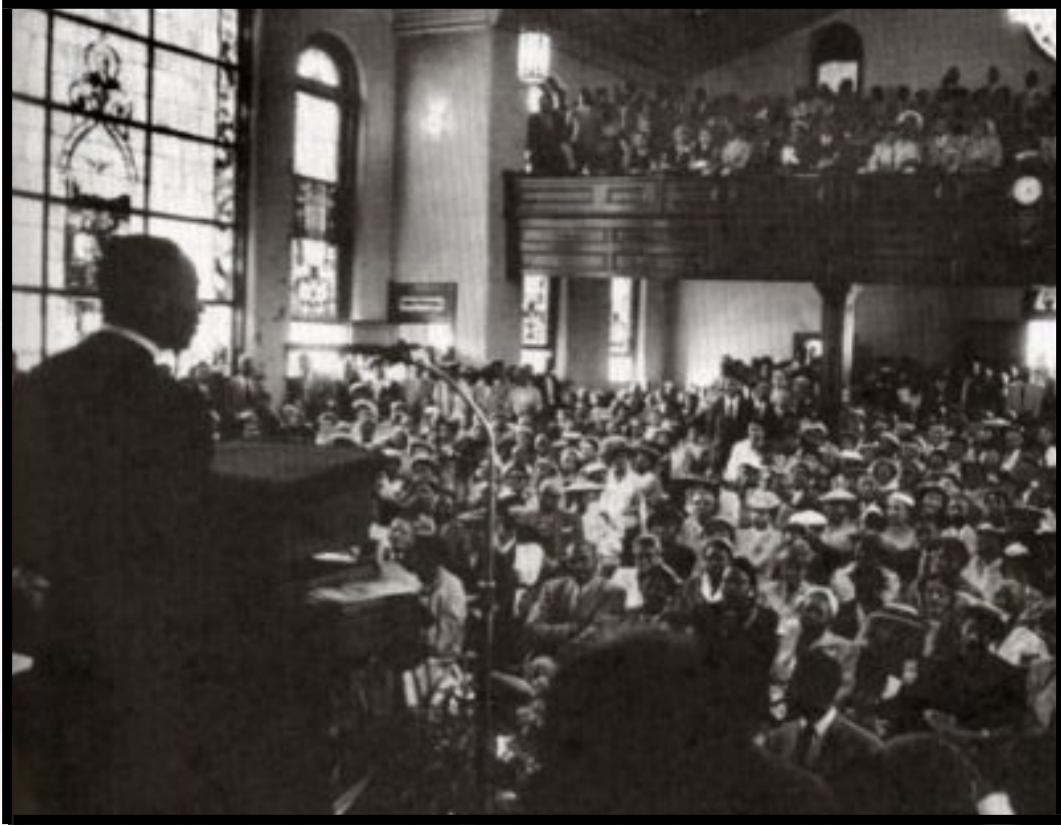
Dr. Martin Luther King Jr. delivering “I’ve Been to the Mountaintop” at the Mason Temple in Memphis.

I said yes. Sheepishly, he replied, “You look like you’re delivering something, so I think I can let you in without any trouble.”. A MIRACLE!